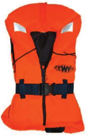
Figure 1: Life Jackets